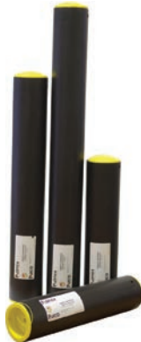
90mm Cartridge Range

NONEX™ AND NXBURST™ CARTRIDGES ARE IDENTICAL PRODUCTS