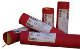
60mm Cartridge Range