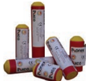
42mm Cartridge Range